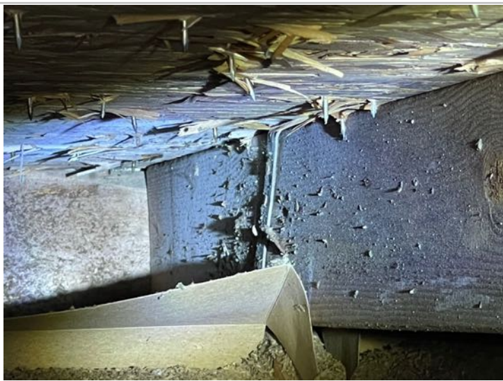
Strap- Anchor Side