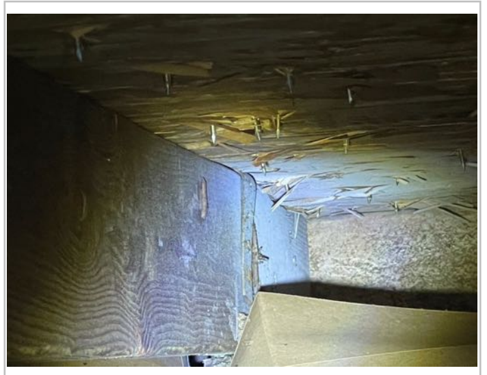
Strap- Opposing Side